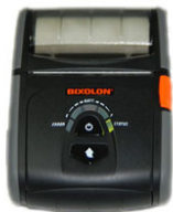
POS Printer Portable