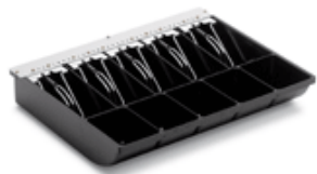
Cash Drawer Inserts