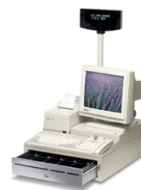
Cash Drawer POS Decks