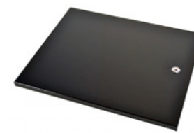
Money Tray Lids